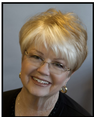
Crossing on a Snowy Bridge