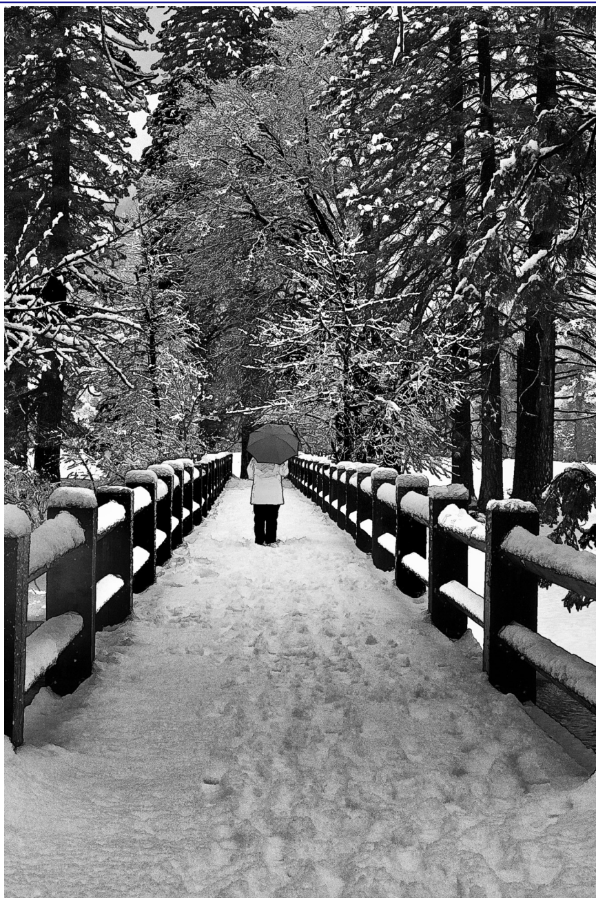
Crossing on a Snowy Bridge by Shelley Stone