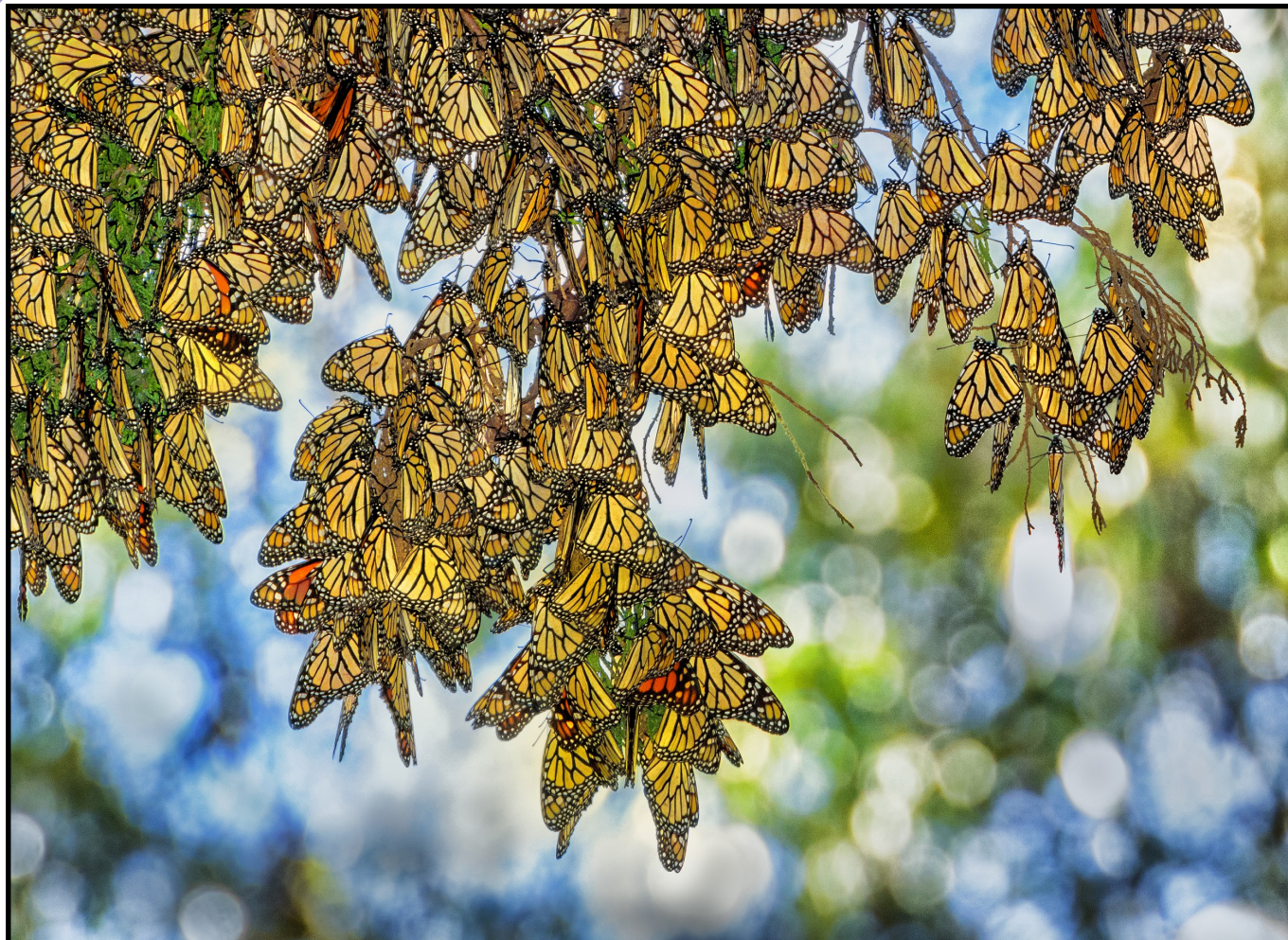
Monarch Butterflies