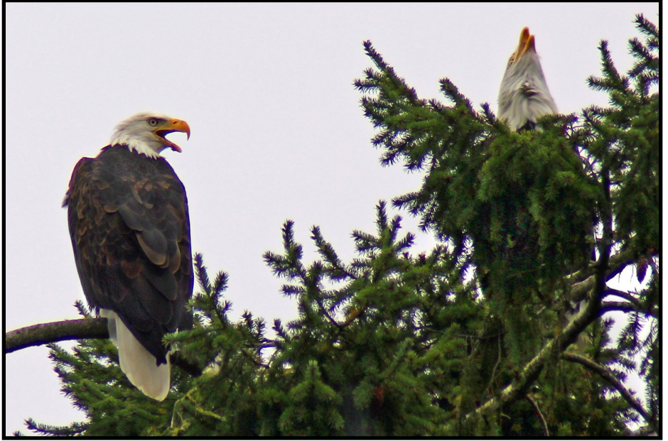
Stop Your Squawking

"Stop your Squawking" was taken on Camano Island Washington about one hour north of Seattle while visiting my sister-in-law. She had been telling me about all the bald eagles she sees daily near her home. We had been there about three days and had not seen a single eagle. Then one day shortly after she left the house she called me to say there was an eagle in a nearby tree. I immediately went there and found the eagle at the top of a tall pine tree. I carefully setup my tripod and using my 60D Canon camera with a Tamron 200mm-400mm lens and started shooting pictures using a variety of exposures. After about 15 minutes of shooting, I moved to get a better view. That is when I discovered the second eagle on an adjacent branch. The birds did not seem to mind me but would get excited when other birds would fly near their roosting area. I moved around to other locations to find the best spot and after about an hour of shooting they flew away. One of my best days of taking photos.