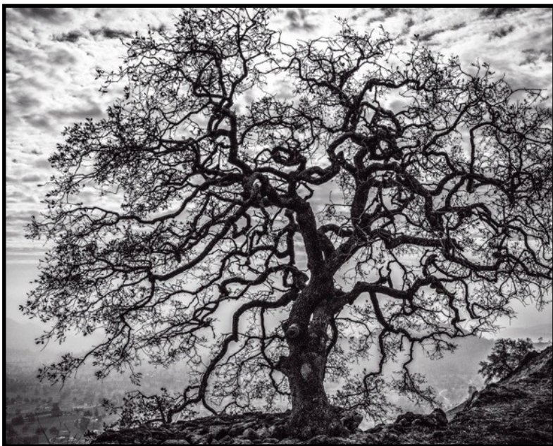
Tree on a Bluff by Jim Olyphant