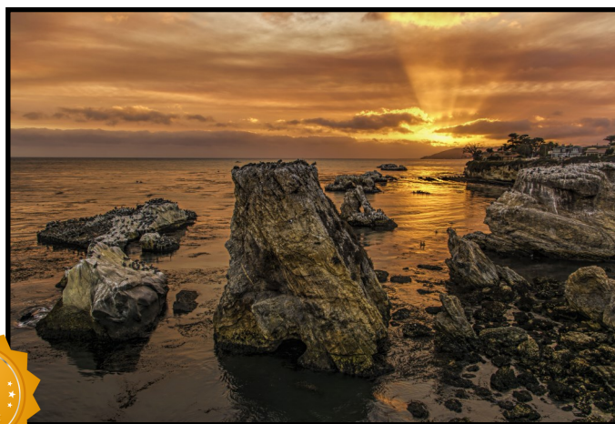
Sunset Beach