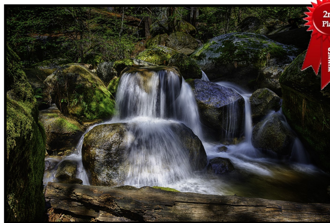
Water and Sunlight at Play by Patrick