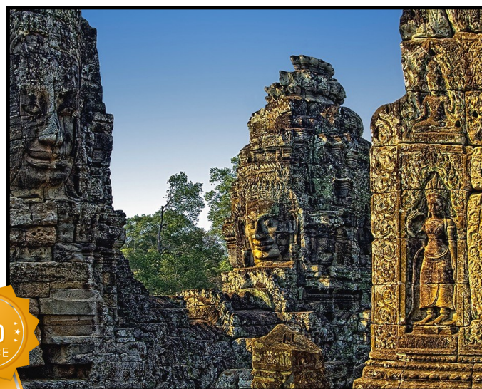
Angkor Thom Cambodia