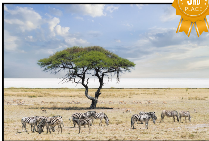
Zebras at Etosha Pan