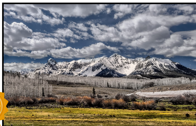
San Juan Mountains