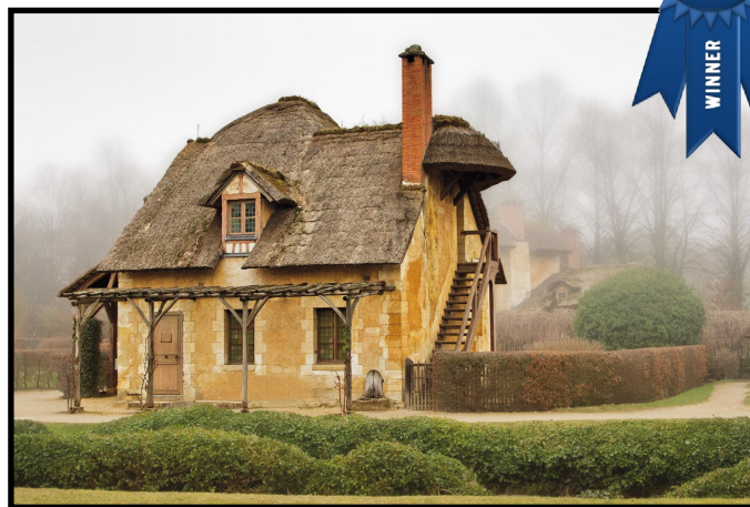
French Cottage at Versailles by James Sanderson