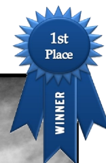
Bristlecone Pine #1 by Art Serabian