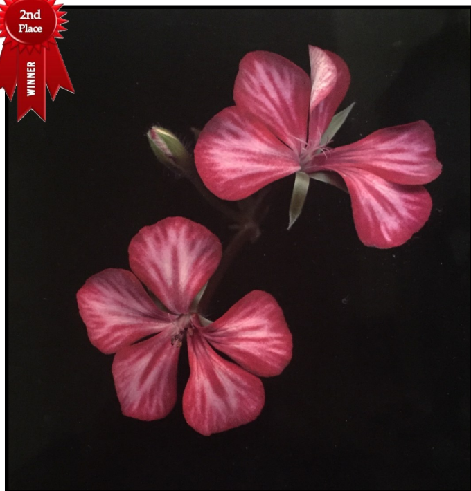
Trio by Tom Fowler