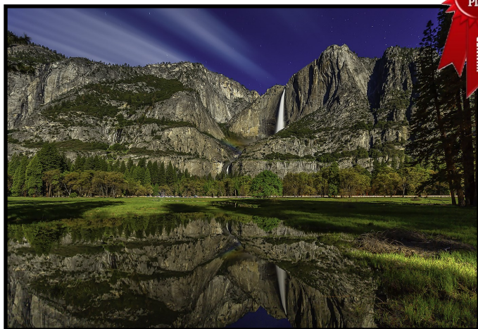
Yosemite Falls Under Moon Light by Ning Lin