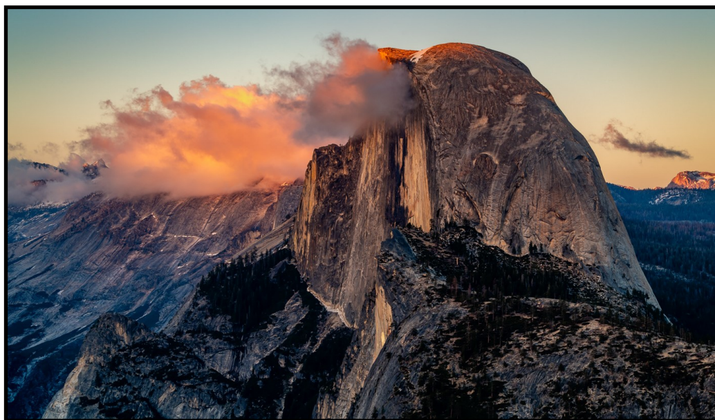
Last Light by Ning Lin