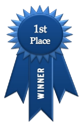
Beauty on the Beach By Shelley Stone