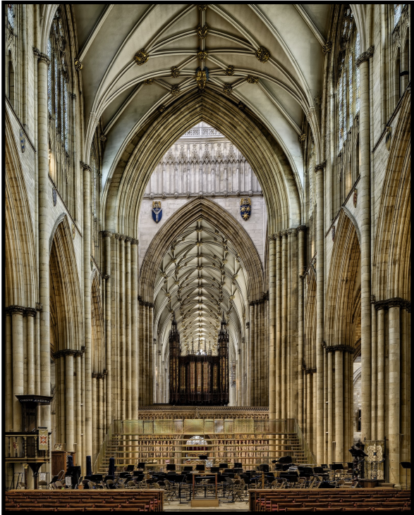
Salisbury Cathedral