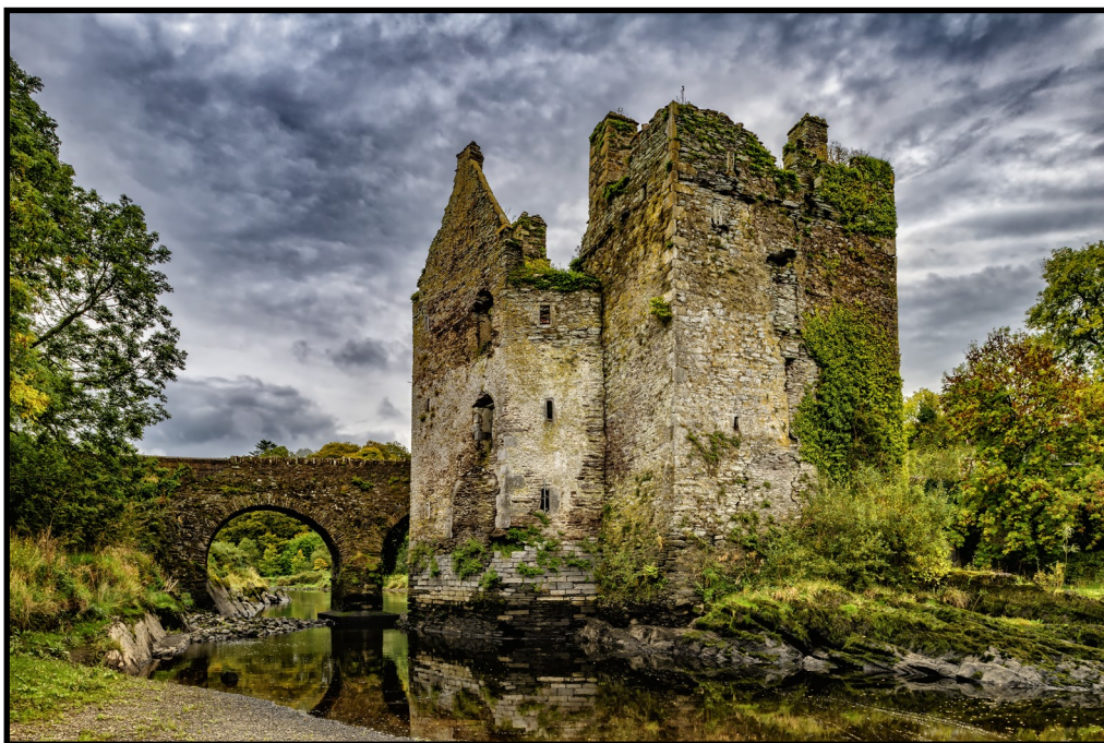
Carrigadrohid Castle