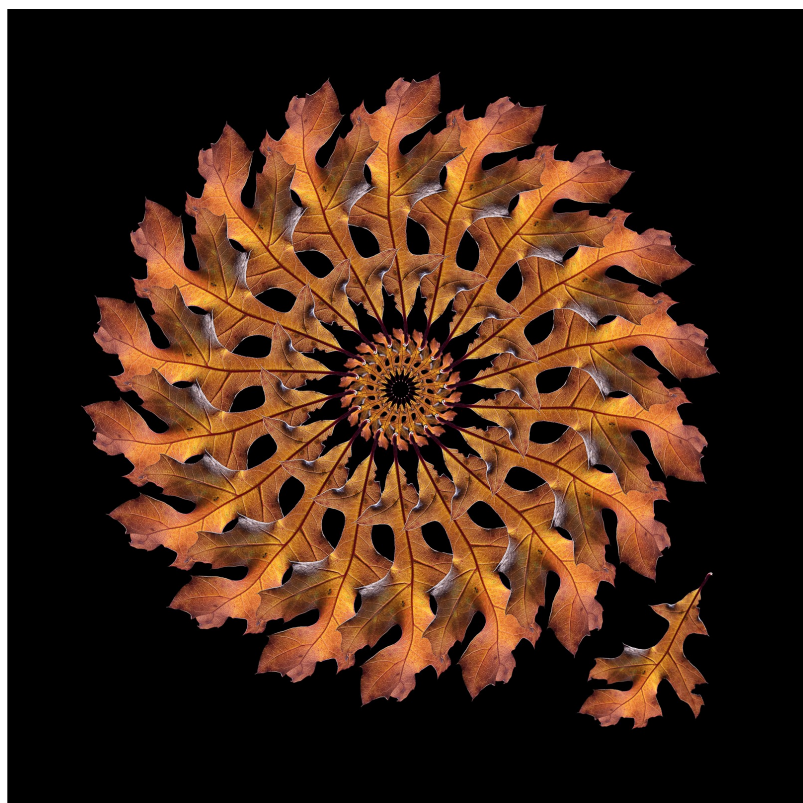
Oak Leaf Wheel by Art Serabian