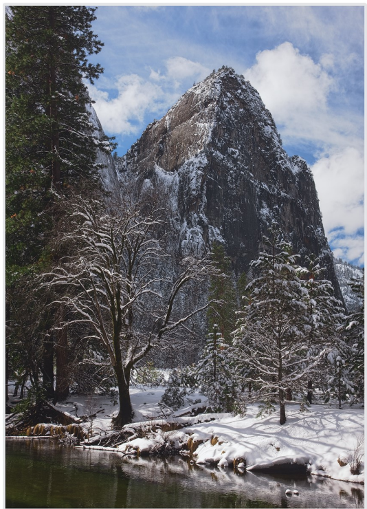
Little Cathedral by Jim Sanderson