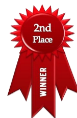
Clouds Over Boathouse by Dee Humphrey