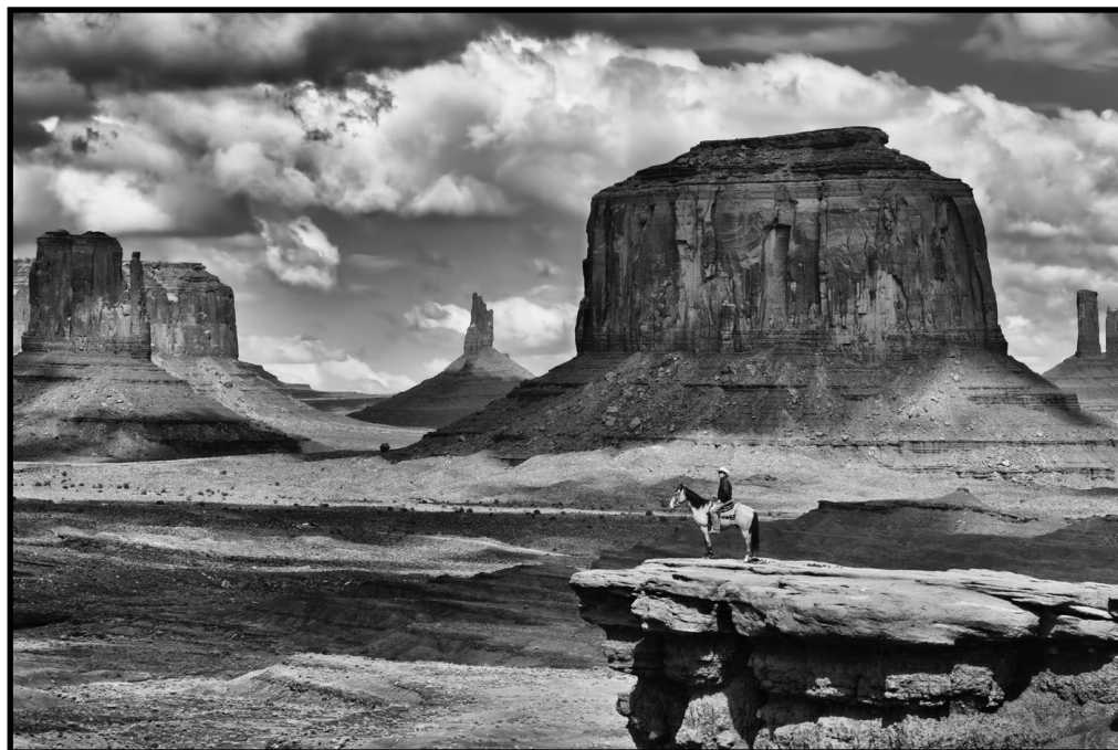
John Ford Point, Monument Valley