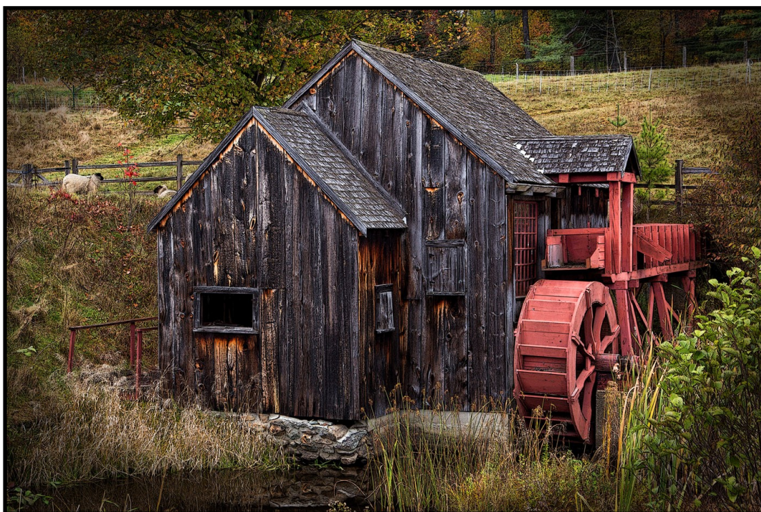
Old Water Wheel by Dee Humphrey