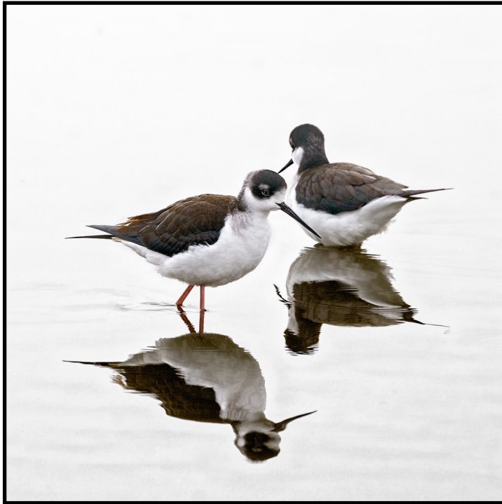
Black Necked Stilts by Jim Sanderson