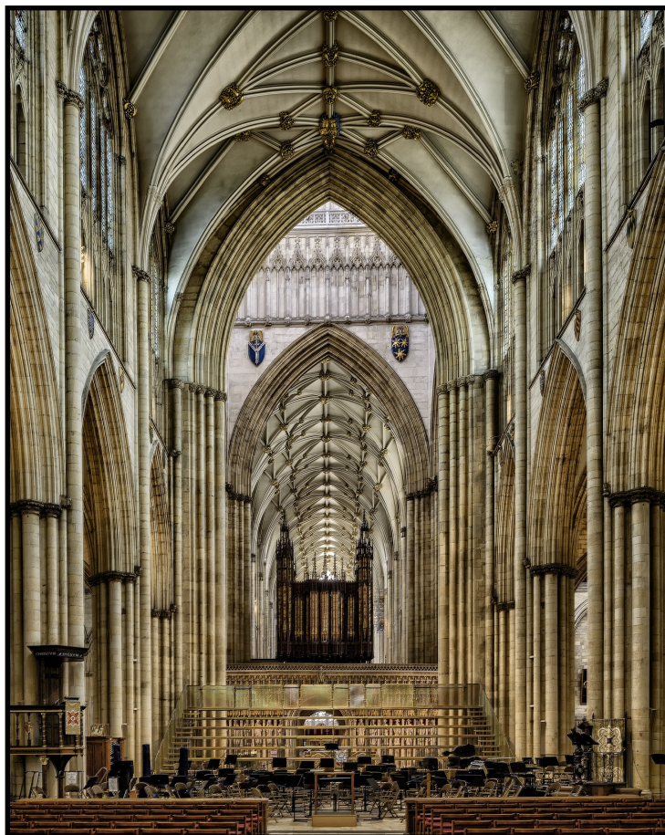
York Minister