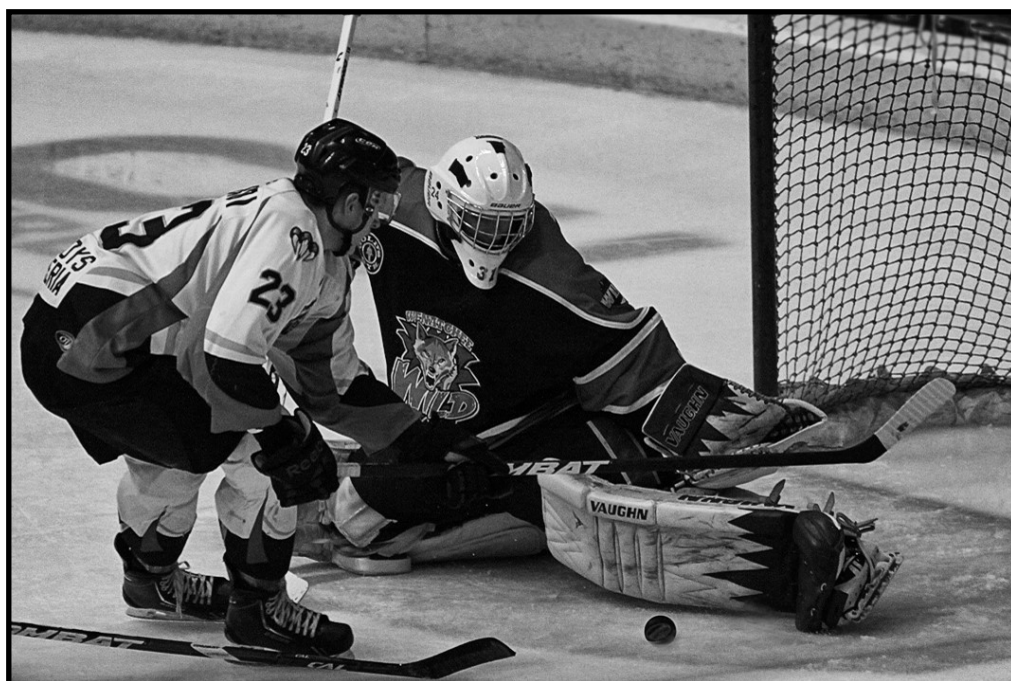
Hockey Action by Loye Stone