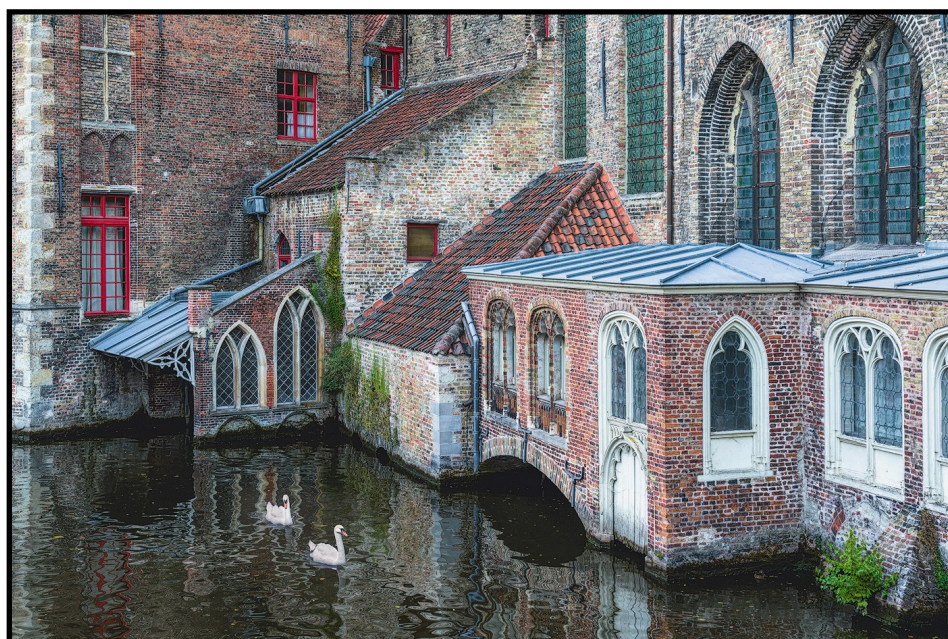
Swans at Rouge