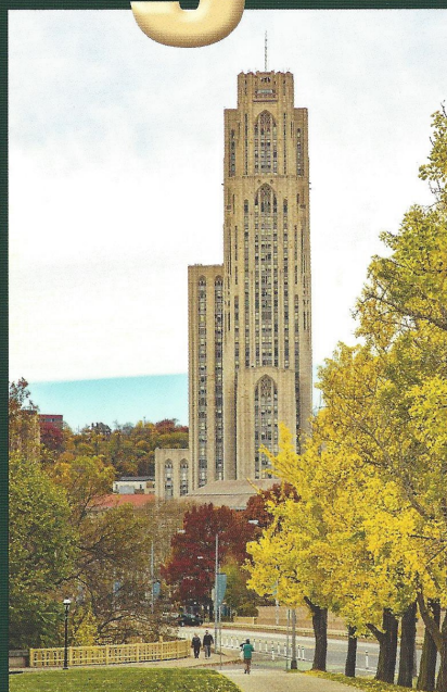
Cathedral of Learning in Autumn.

speakers, Division presentations, photo workshops, and 13 photography tours, including a riverboat cruise and visits to Frank Lloyd Wright's Fallingwater, an abandoned steel mill, Phipps Conservatory, and more. The PSA Conference provides many great opportunities to share your photographic interests and improve your photo skills. Come to Pittsburgh and renew old friendships and make new ones.