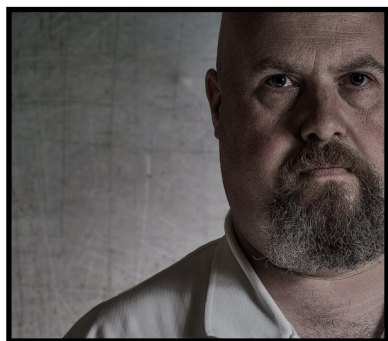
Fresno Camera Club June Digital Chairs Report

Entries for June were back up and matched February with 60 images entered by 20 members. Entries were much better this month with hardly any problems with either naming or file sizes. Thank You!