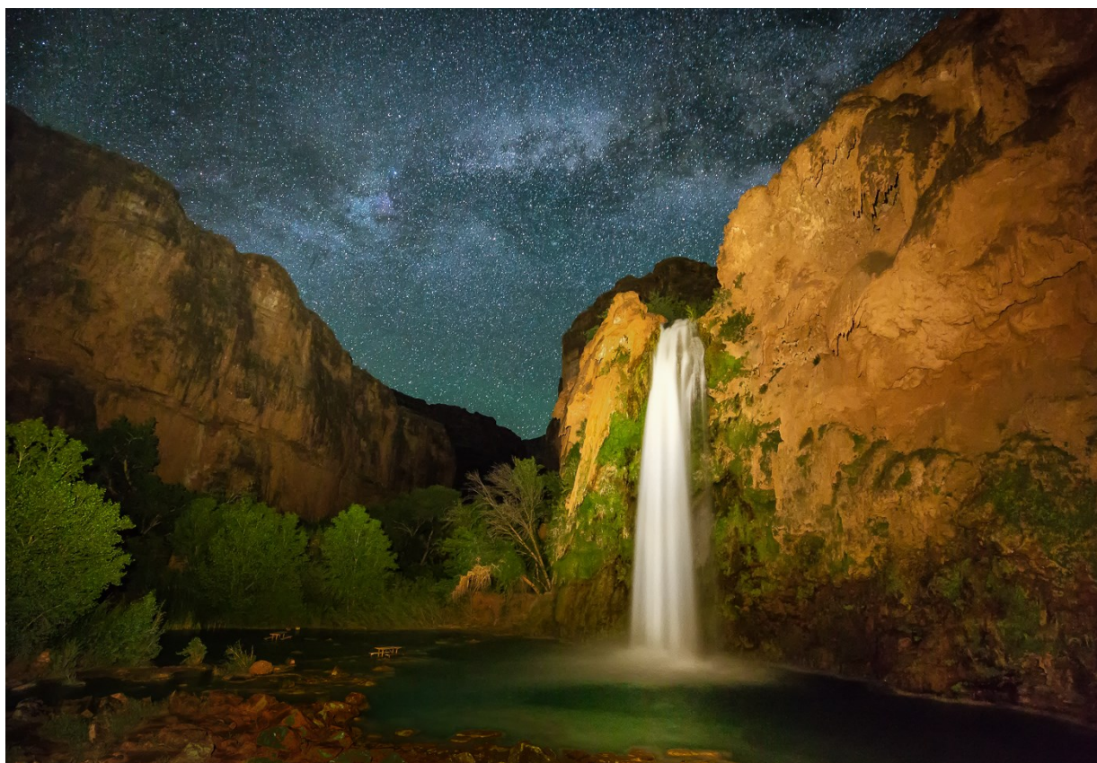
Havasu Falls and Milky Way