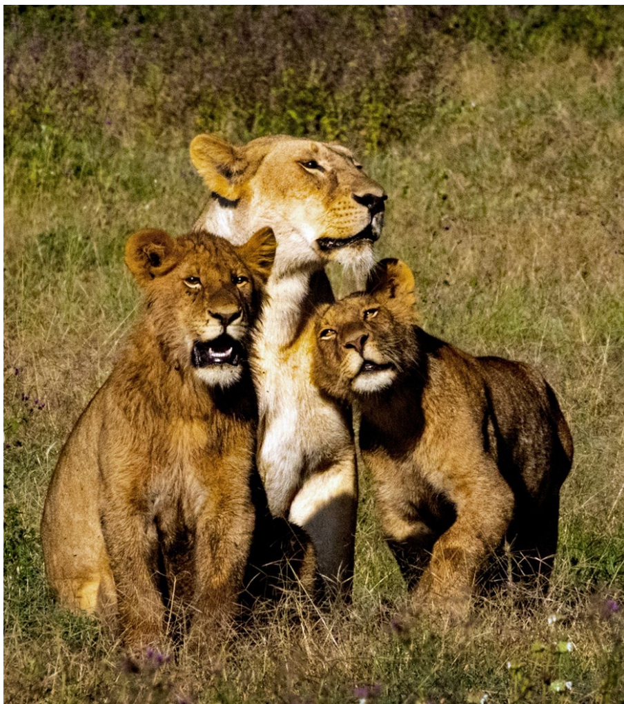
Lioness and Loving Cubs 2 by Loye Stone PPSA

September Meeting moved up a week to September 13th