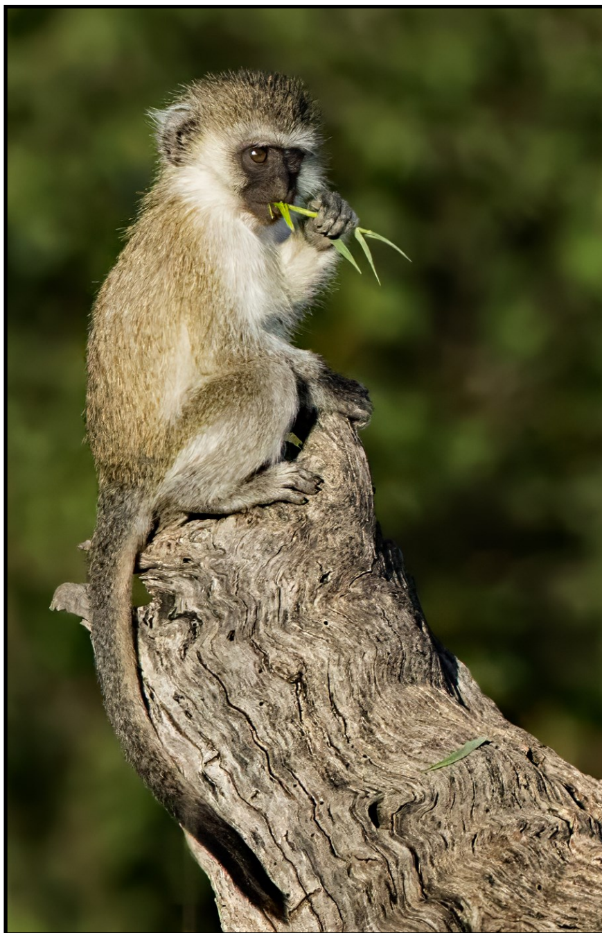
Young Vervet Monkey—Tanzania