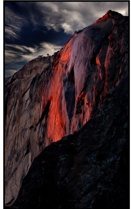
Horsetail Falls