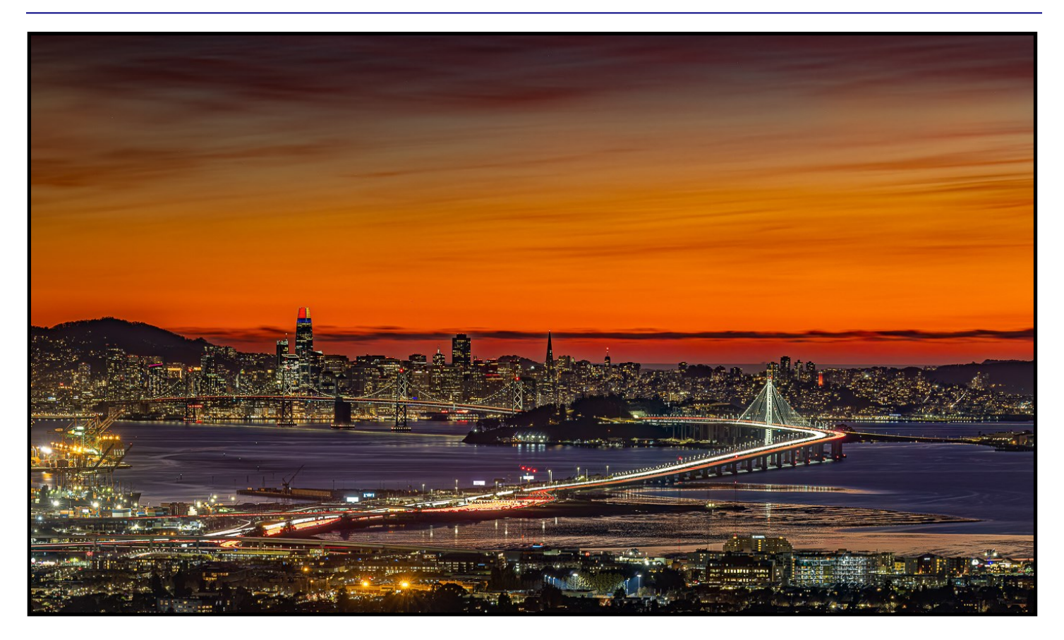
Sunset San Francisco