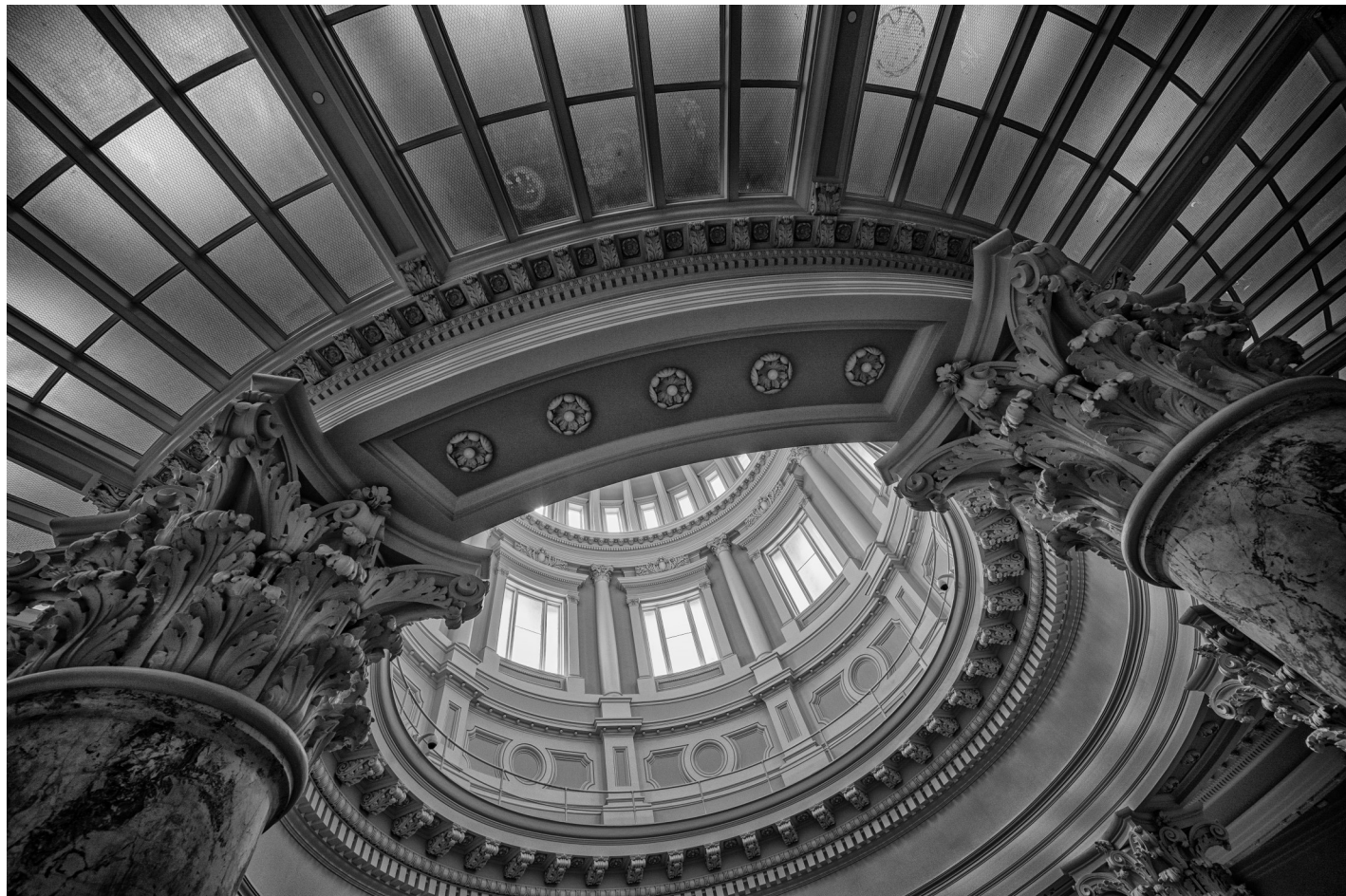
Boise Capitol Ceiling